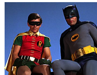
Ranking the Best Classic TV Shows: What Do You Think?