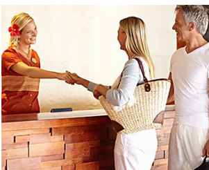
Give Your Business a Warm Welcome with IaaS